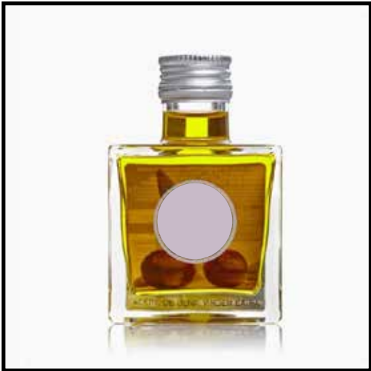
Extra Virgin Olive Oil Square Bottle 100ml