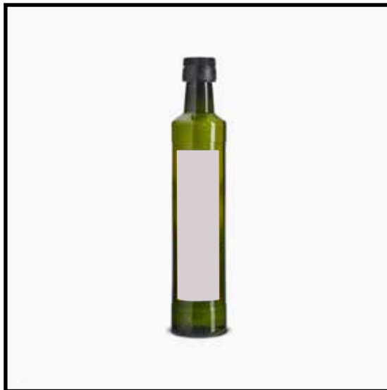
Extra Virgin Olive Oil PET500ml