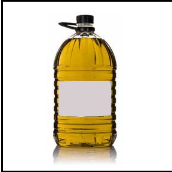
Extra Virgin Olive Oil PET 5 L