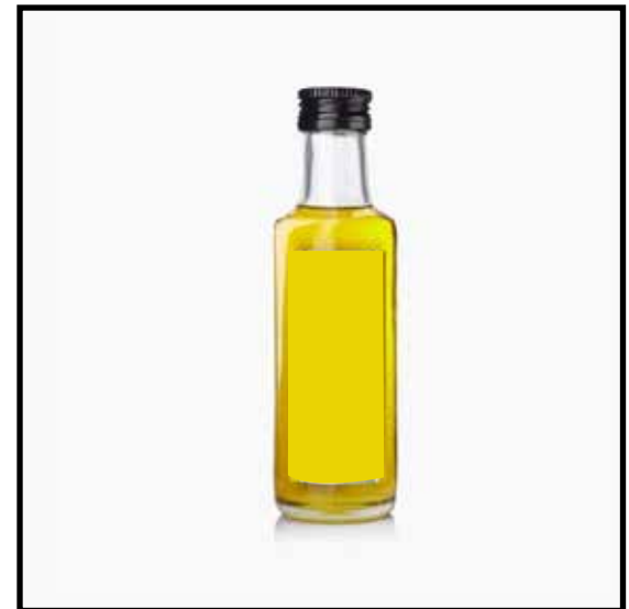
Extra Virgin Olive Oil Glass Bottle 100 ml