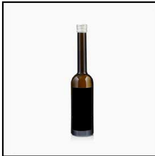
Extra Virgin Olive Oil Chamomile 500 ml/250ml