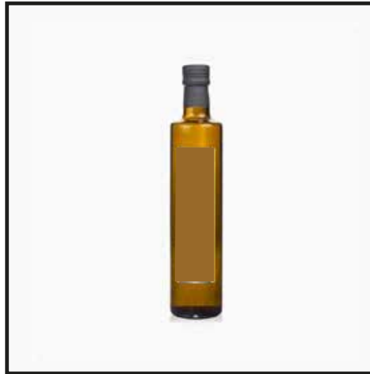
Extra Virgin Olive Oil Glass Bottle 500 ml