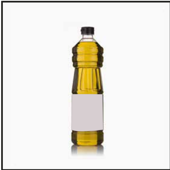
Extra Virgin Olive Oil PET 1 L