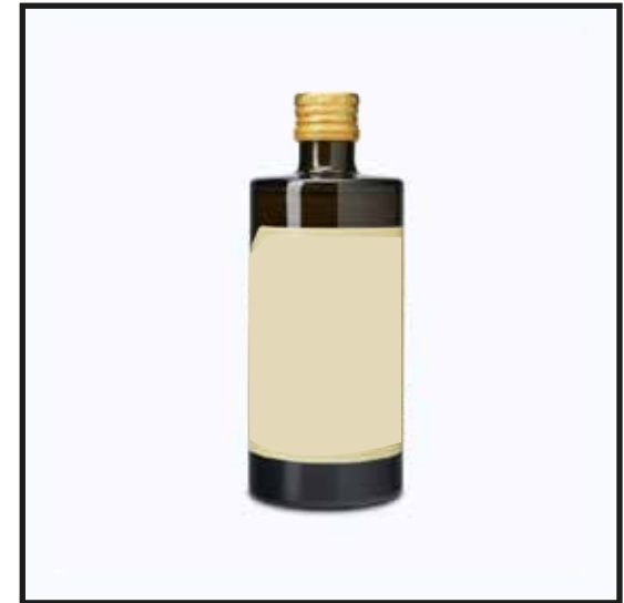
Organic Extra Virgin Olive Oil