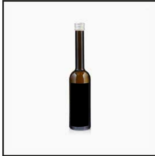
Picual Extra Virgin Olive Oil 500 ml / 250ml