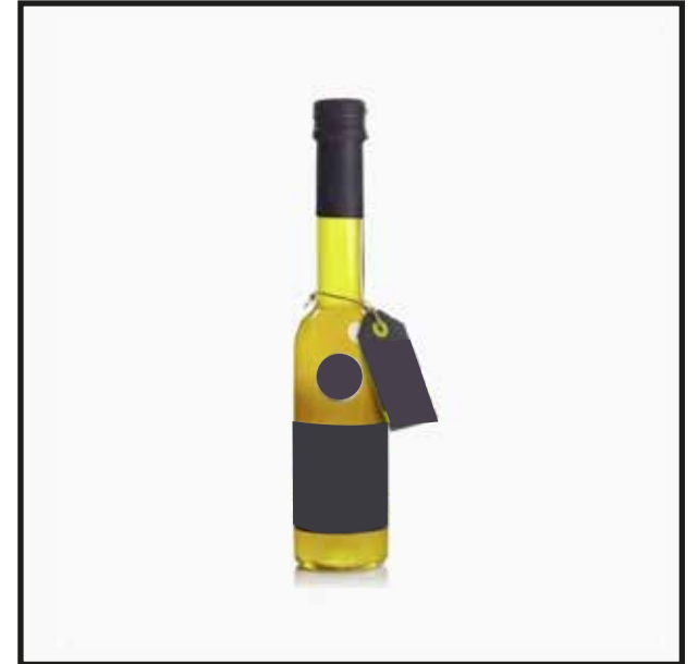
Fresh Chamomile Extra Virgin Olive Oil 250 ml