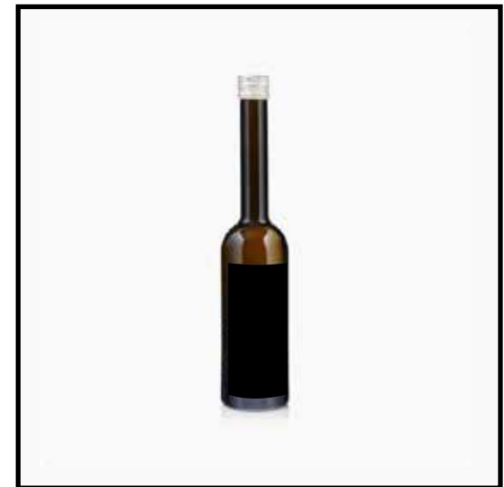
Arbequina Extra Virgin Olive Oil 500 ml/250ml