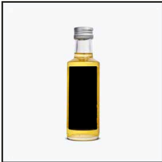
Hazelnut oil, organic sunflower oil, organic walnut oil, organic sesame oil.