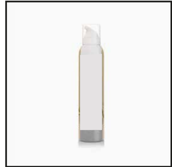
Extra virgin olive oil spray 200 ml