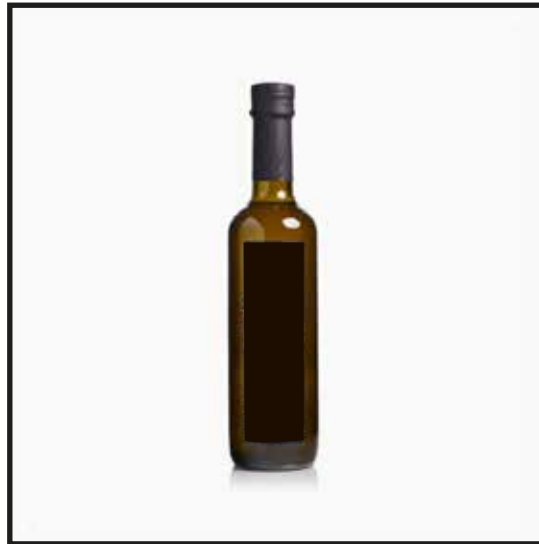
Extra Virgin Olive Oil 'En Rama' 500 ml