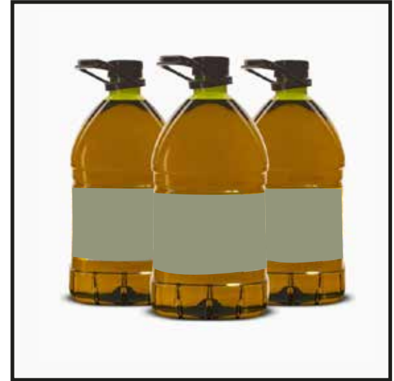
Extra Virgin Olive Oil PET 3 L