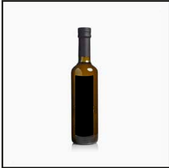
Organic Extra Virgin Olive Oil 500ml