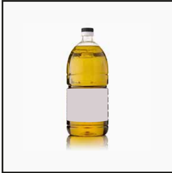
Extra Virgin Olive Oil PET 2 L