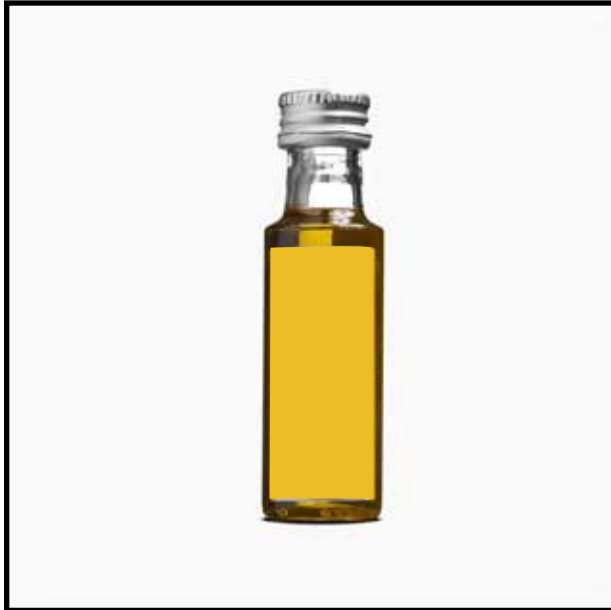
Miniature Extra Virgin Olive Oil 25 ml