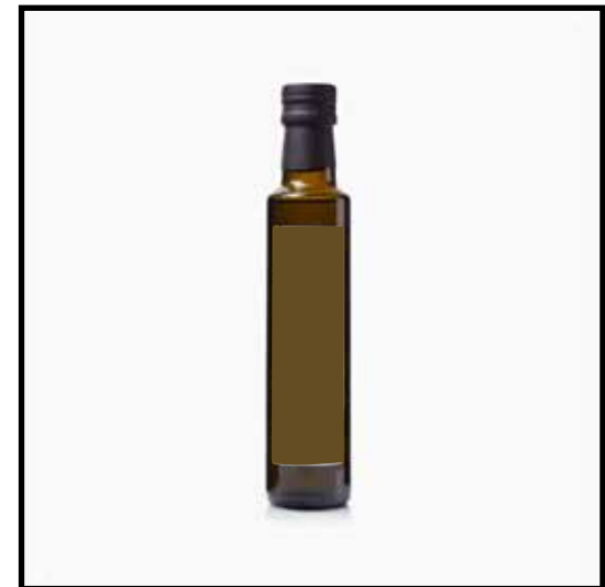
Extra Virgin Olive Oil Glass Bottle 250 ml