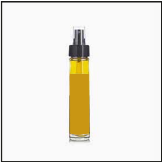
Extra virgin olive oil spray 50ml