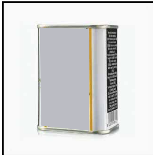
Extra Virgin Olive Oil Can 100 ml/ 250ml/ 500ml/ 3L /5L.