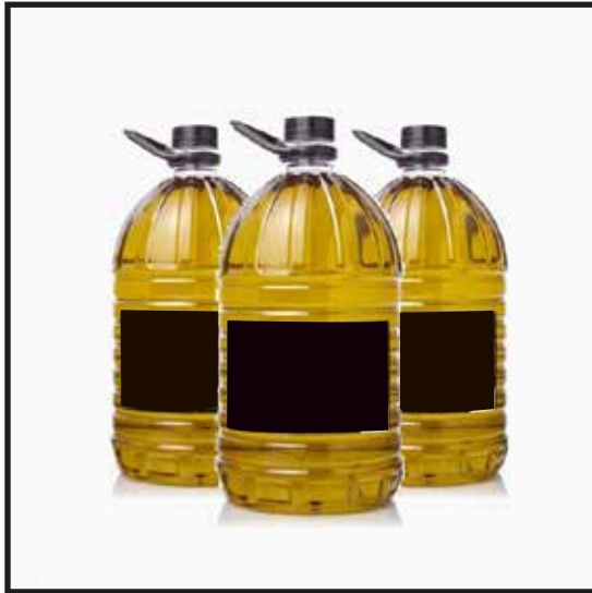
Organic Extra Virgin Olive Oil PET 5L (Box of 3 bottles)