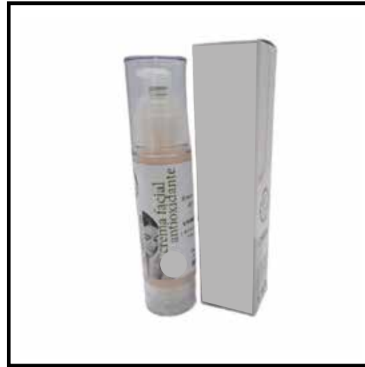
Olive Oil Facial Cream with Vitamin C