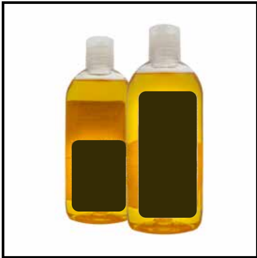
Extra Virgin Olive Oil Shampoo