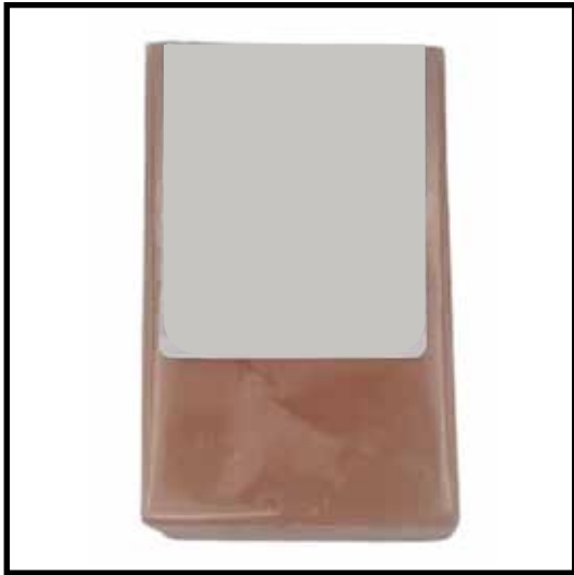
Handmade soap made from extra virgin olive oil and shea butter