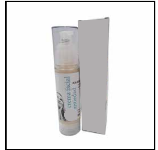
Anti-aging facial cream with olive oil and collagen