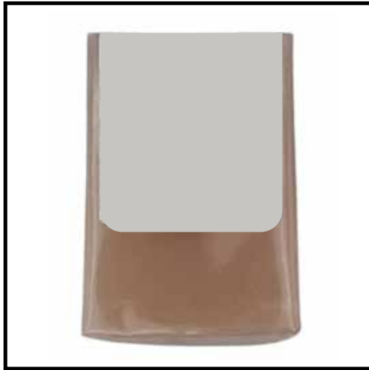
Handmade soap made from extra virgin olive oil and clays