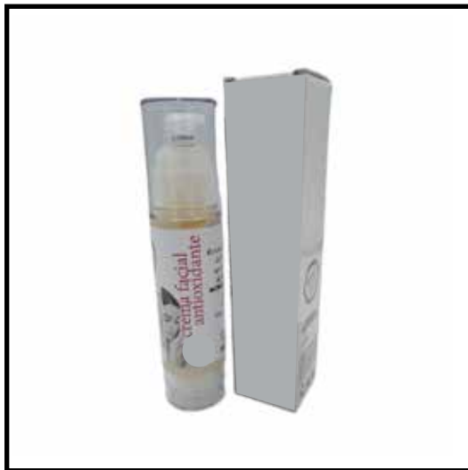
Antioxidant Facial Cream with Olive Oil and Rosehip