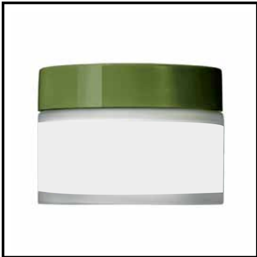
Anti-Wrinkle Hydronutritive Facial Cream 50ml