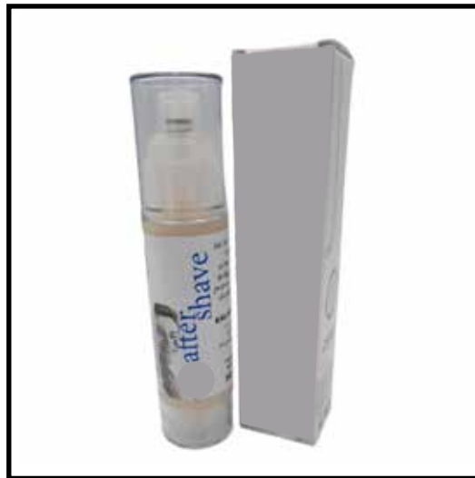
Olive Oil After Shave