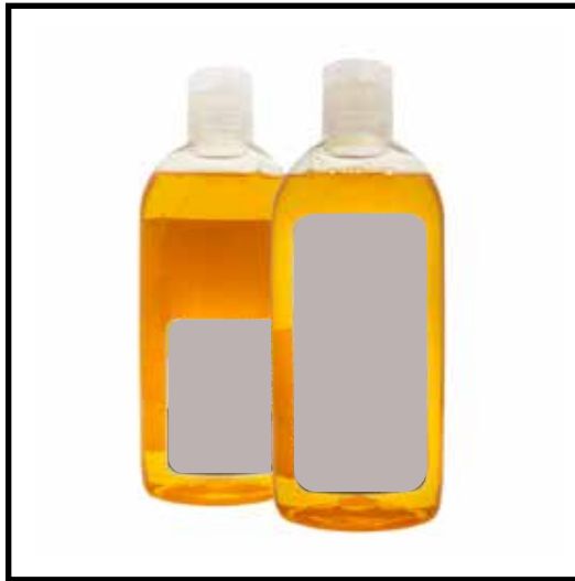
Extra Virgin Olive Oil Bath Gel