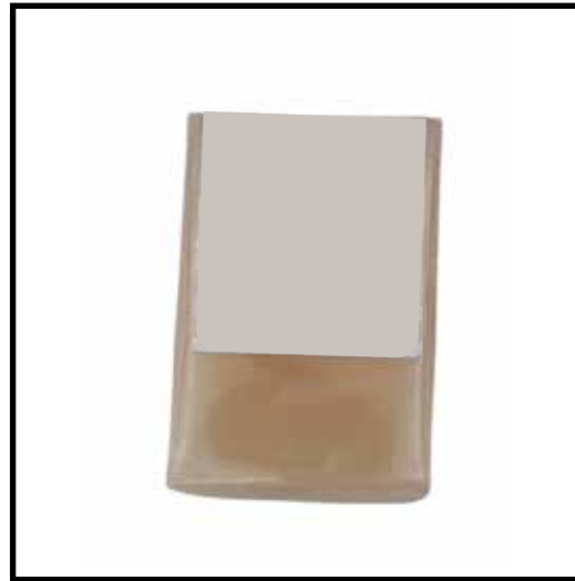
Handmade soap with extra virgin olive oil, honey and propolis