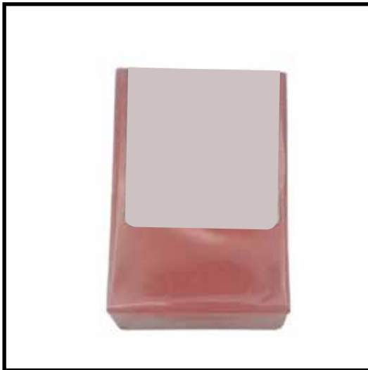
Handmade soap made from extra virgin olive oil and rosehip