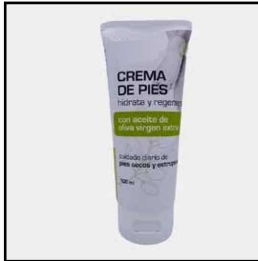
Foot Cream Moisturizing and Regenerating