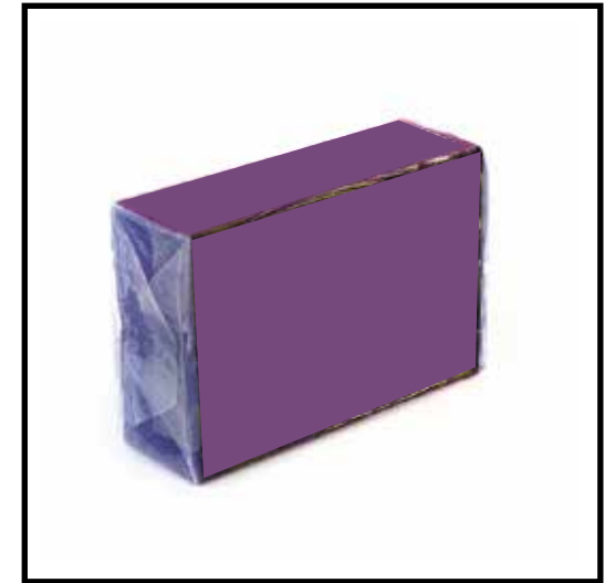
Extra Virgin Olive Oil and Lavender Soap