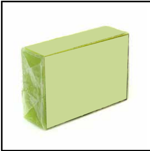
Extra Virgin Olive Oil and Aloe Vera Soap