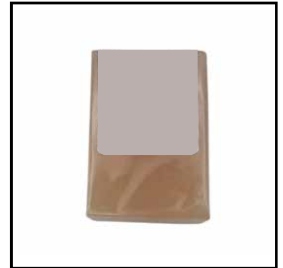
Handmade soap made from extra virgin olive oil and argan