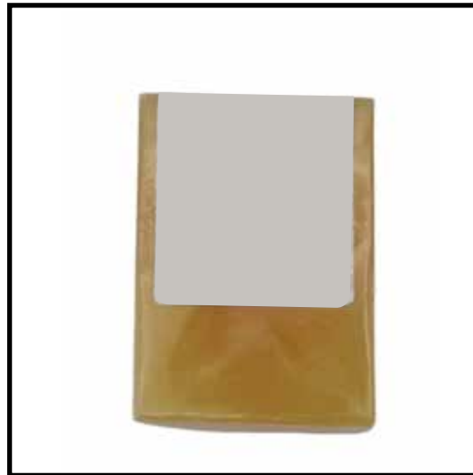
Handmade soap with extra virgin olive oil and grapefruit