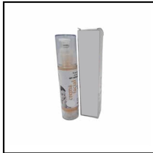
Olive Oil Facial Cream with Intrinsic SPF