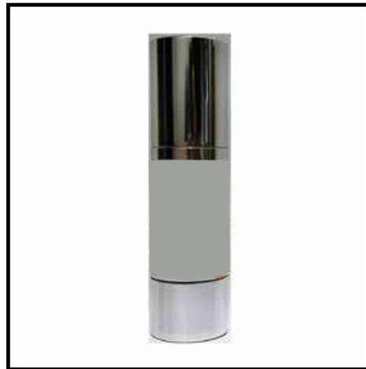
Organic Argan Oil and Extra Virgin Olive Oil Rich in Oleocanthal 30ml