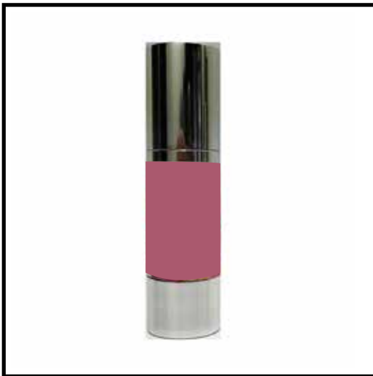
Rosehip Oil and Organic Extra Virgin Olive Oil 30ml