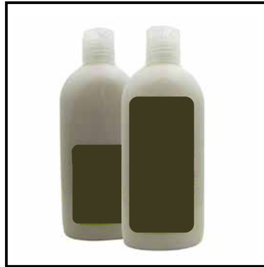
Extra Virgin Olive Oil Body Milk 250ml