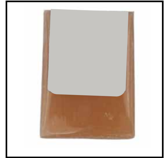
Handmade soap with extra virgin olive oil and calendula