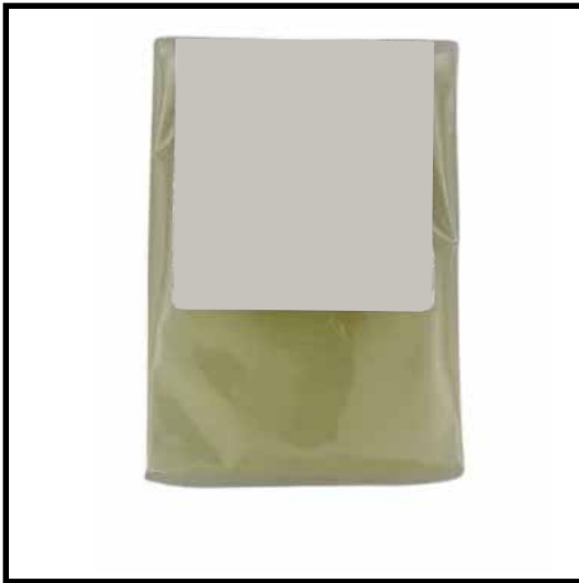
Handmade soap with extra virgin olive oil and aloe vera