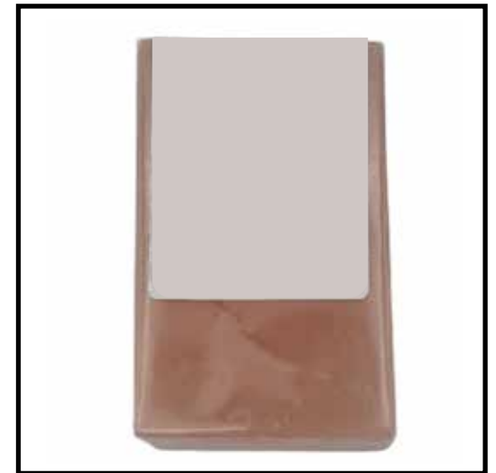
Handmade soap made from extra virgin olive oil and argan