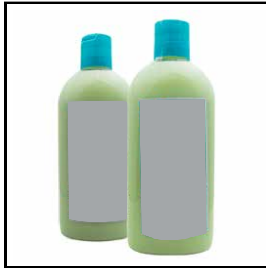
After Sun with Extra Virgin Olive Oil Enriched with Aloe Vera