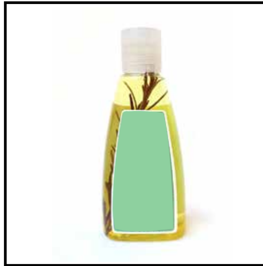
Rosemary Alcohol and Organic EVOO