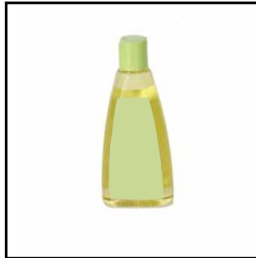
Body Oil Bath Massage Extra Virgin Olive Oil