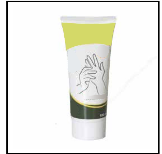
Extra Virgin Olive Oil Hand and Nail Cream 100 ml.