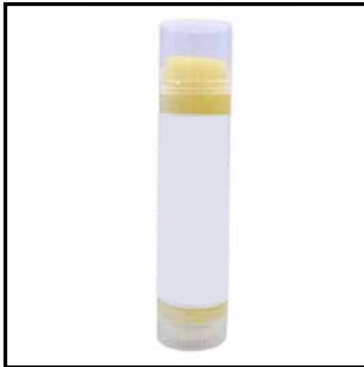
Lip Balm with EVOO 4gr