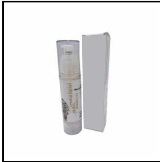
Olive Oil Facial Cream with Hyaluronic Acid and Collagen.